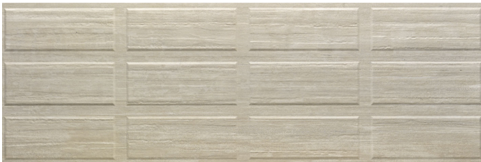
Suite Hotel Vison