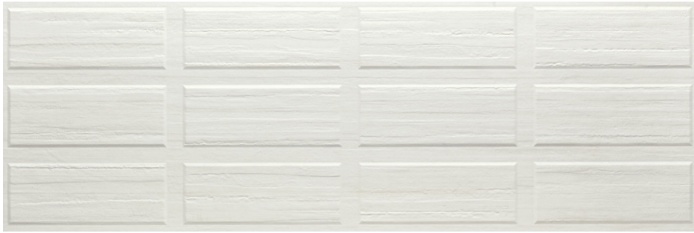
Suite Hotel Blanco