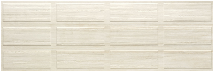
Suite Hotel Beige