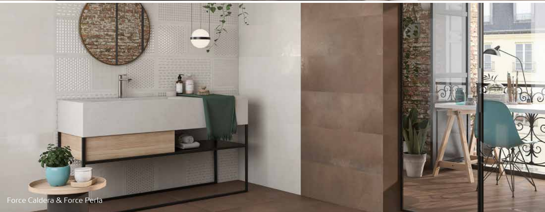
Force Caldera & Force Perla