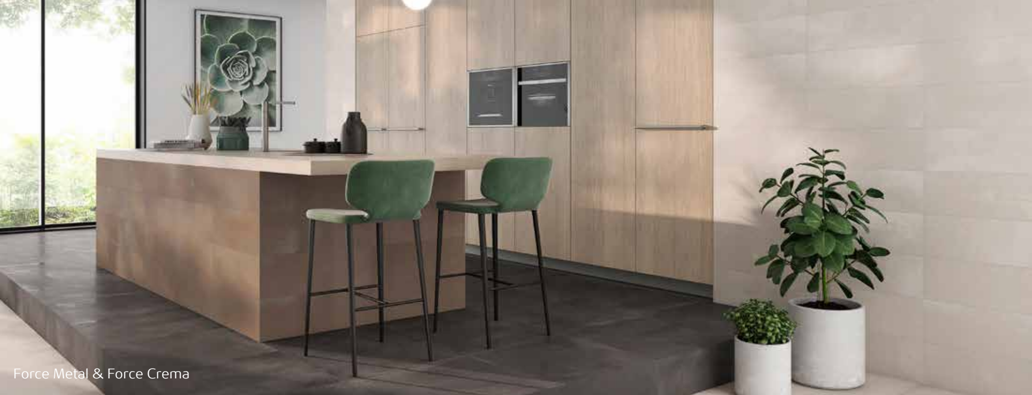
Force Metal & Force Crema