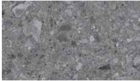
Mood Dark Grey