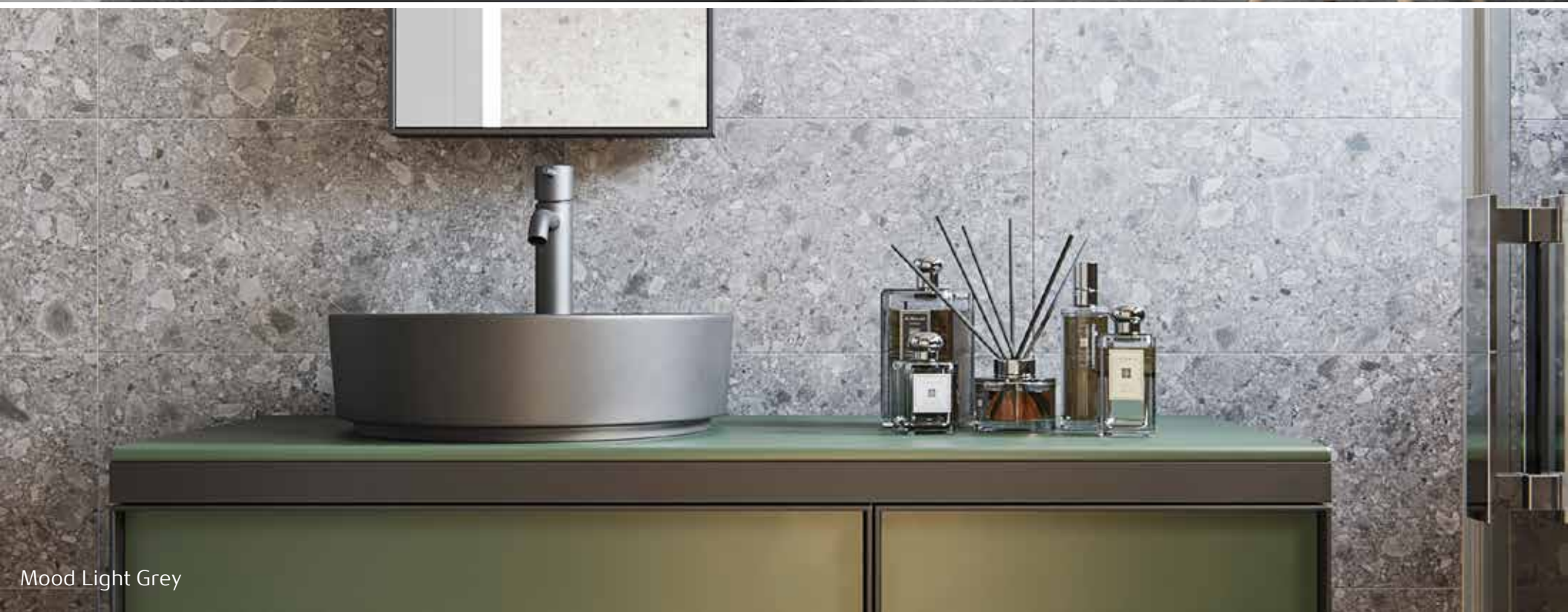
Mood Light Grey