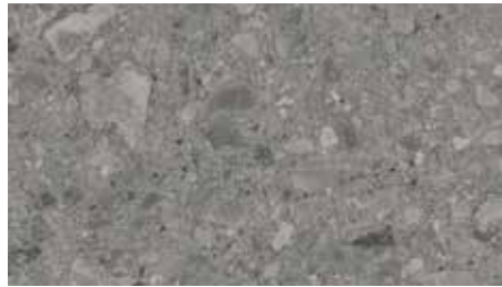
Mood Light Grey