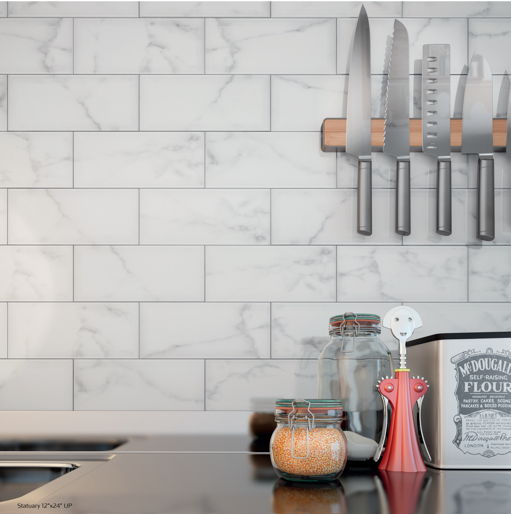
Statuary 12"x24" UP

Statuary, the spirit of marble. A contemporary take on natural Italian marble, setting new standards in styles and trends whilst conserving all its prestige and quality. A faithful ceramic adaptation of marble with the same aesthetic effect, adding more design and enhanced functionality.