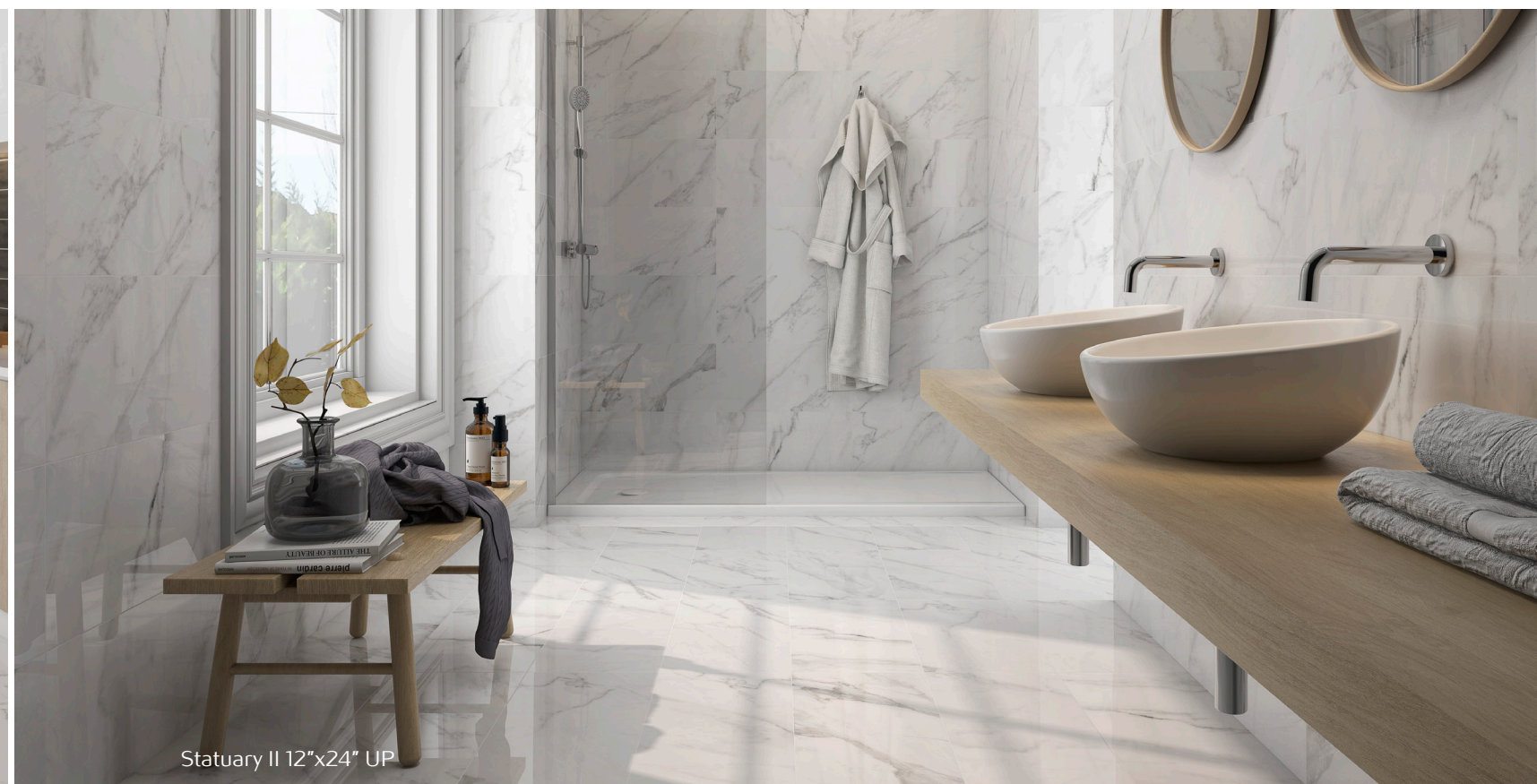
Statuary II 12"x24" UP