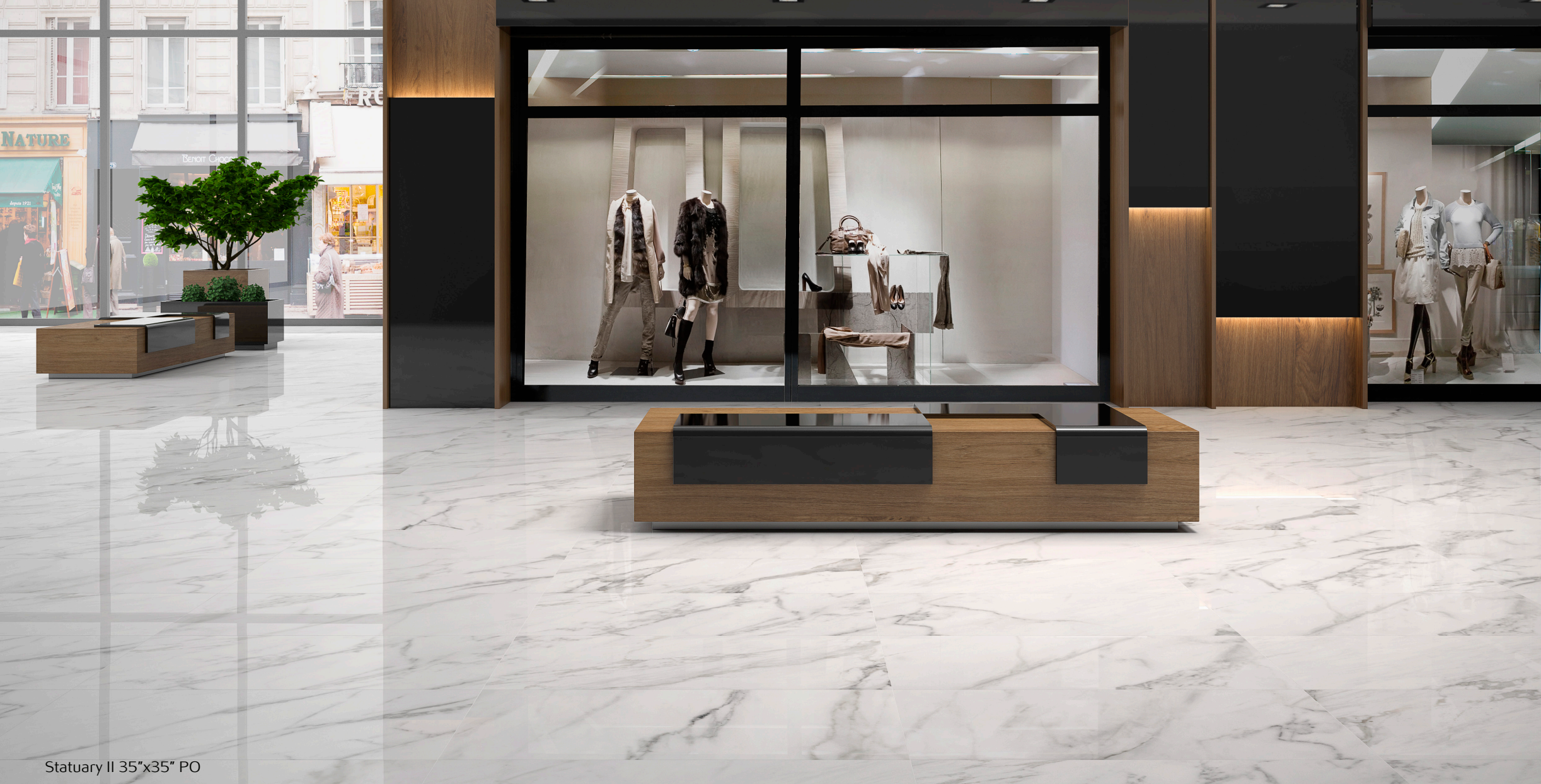
Statuary II 35"x35" PO