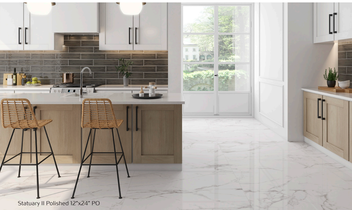
Statuary II Polished 12"x24" PO