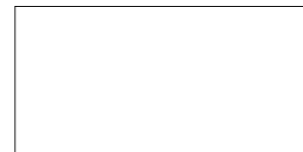
48"x98" R PO