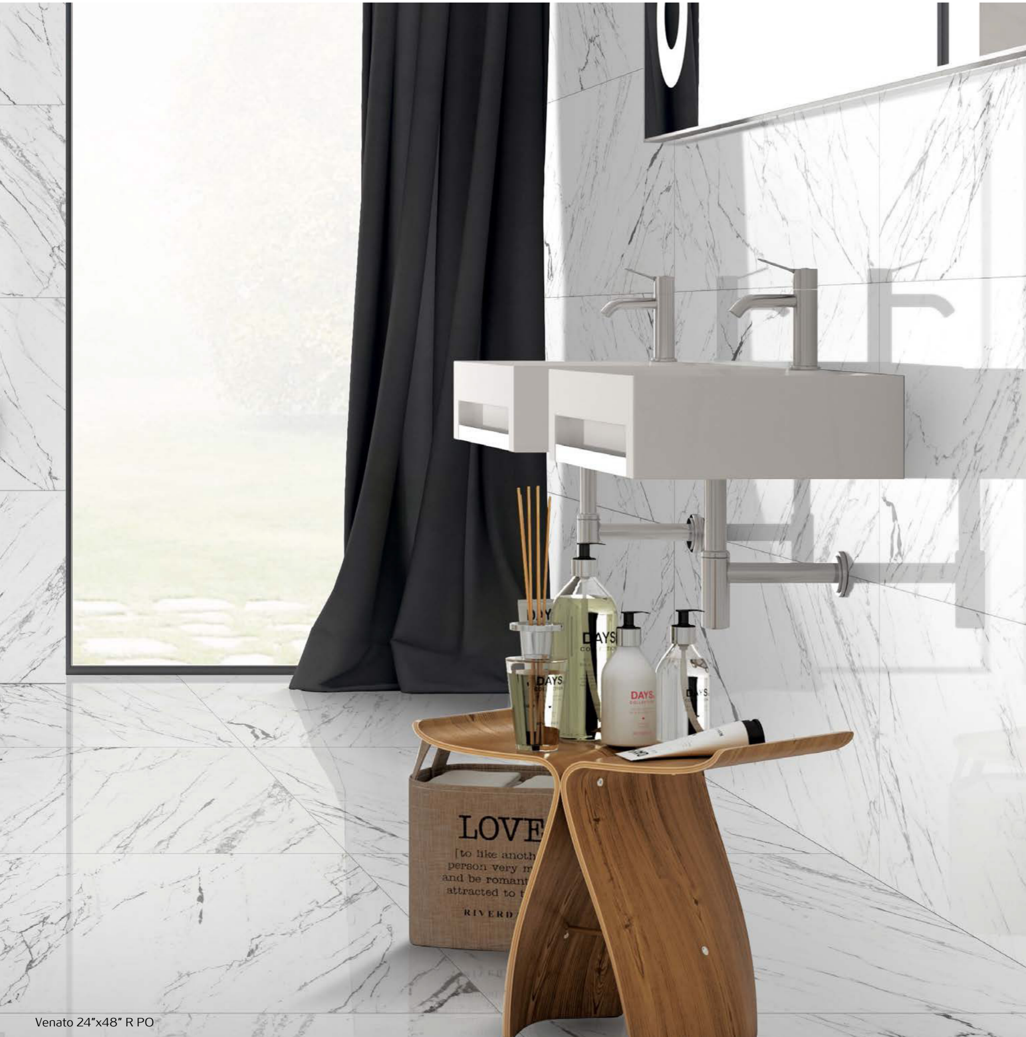
Venato 24"x48" R PO

The Statuario Venato series is inspired by this precious and timeless Italian marble, with veins in shades of gray that run through longitudinally through its pieces. Available in polished and matte finishes, HD printing brings this porcelain to life with its realism, elegance and contemporary character.