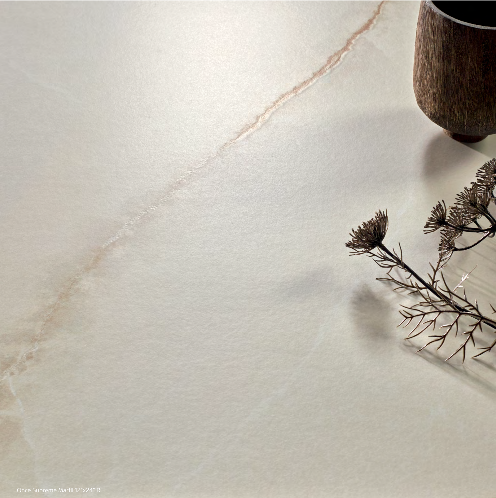
Onice Supreme Marfil 12"x24" R

Onice Supreme majestically captures the essence of nature in every piece. Inspired by the sublime beauty of onyx. Its refined texture features golden veining and translucent cream tones, creating a serene, sophisticated aesthetic. This marble finish elevates any space, transforming it into a luxurious sanctuary of tranquility and grace.