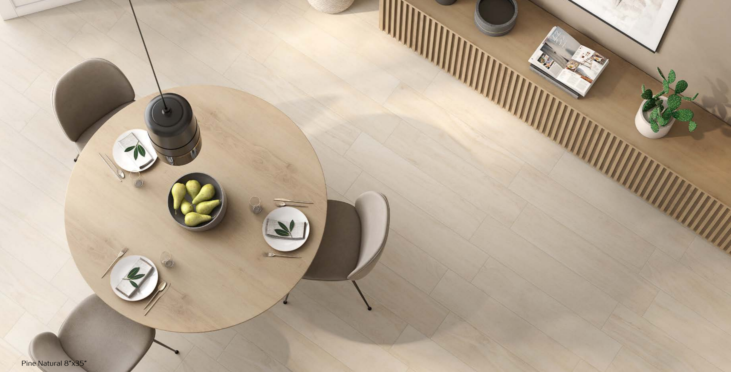
Pine Natural 8"x35"