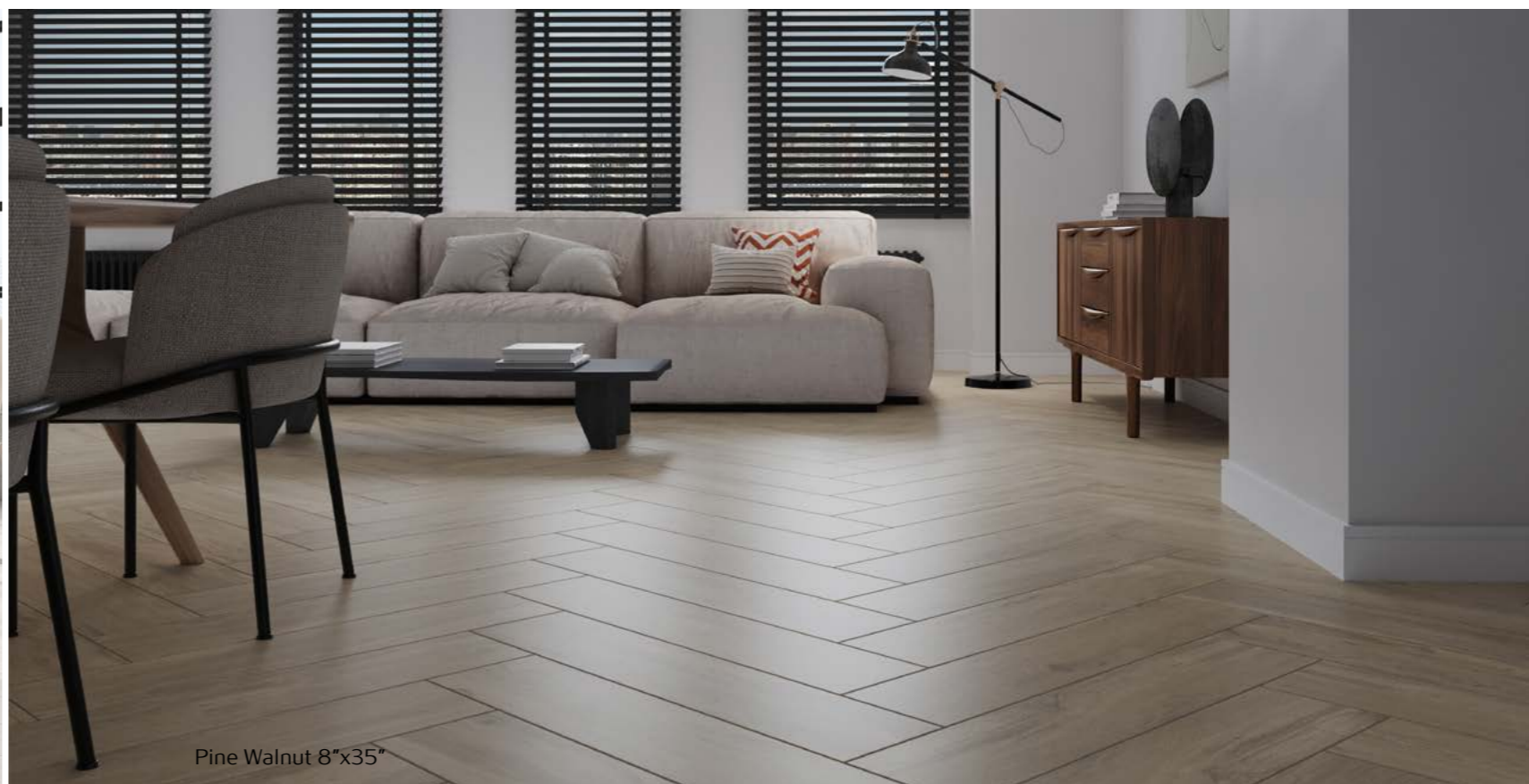
Pine Walnut 8"x35"