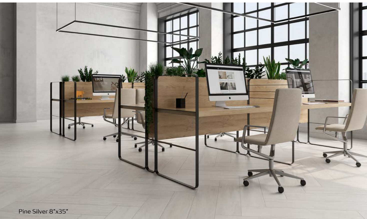
Pine Silver 8"x35"