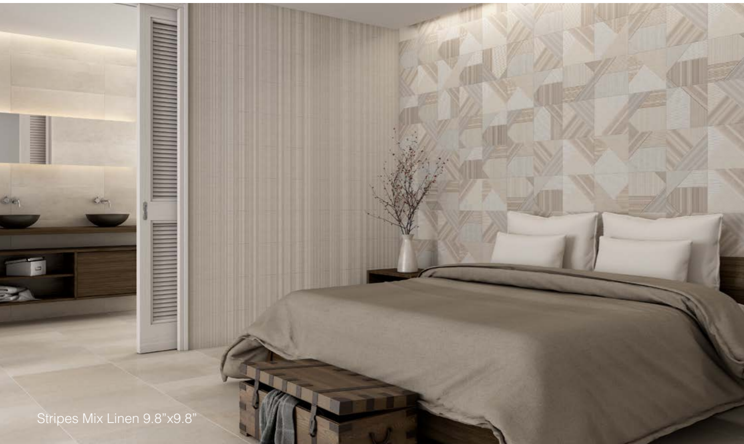
Stripes Mix Linen 9.8"x9.8"