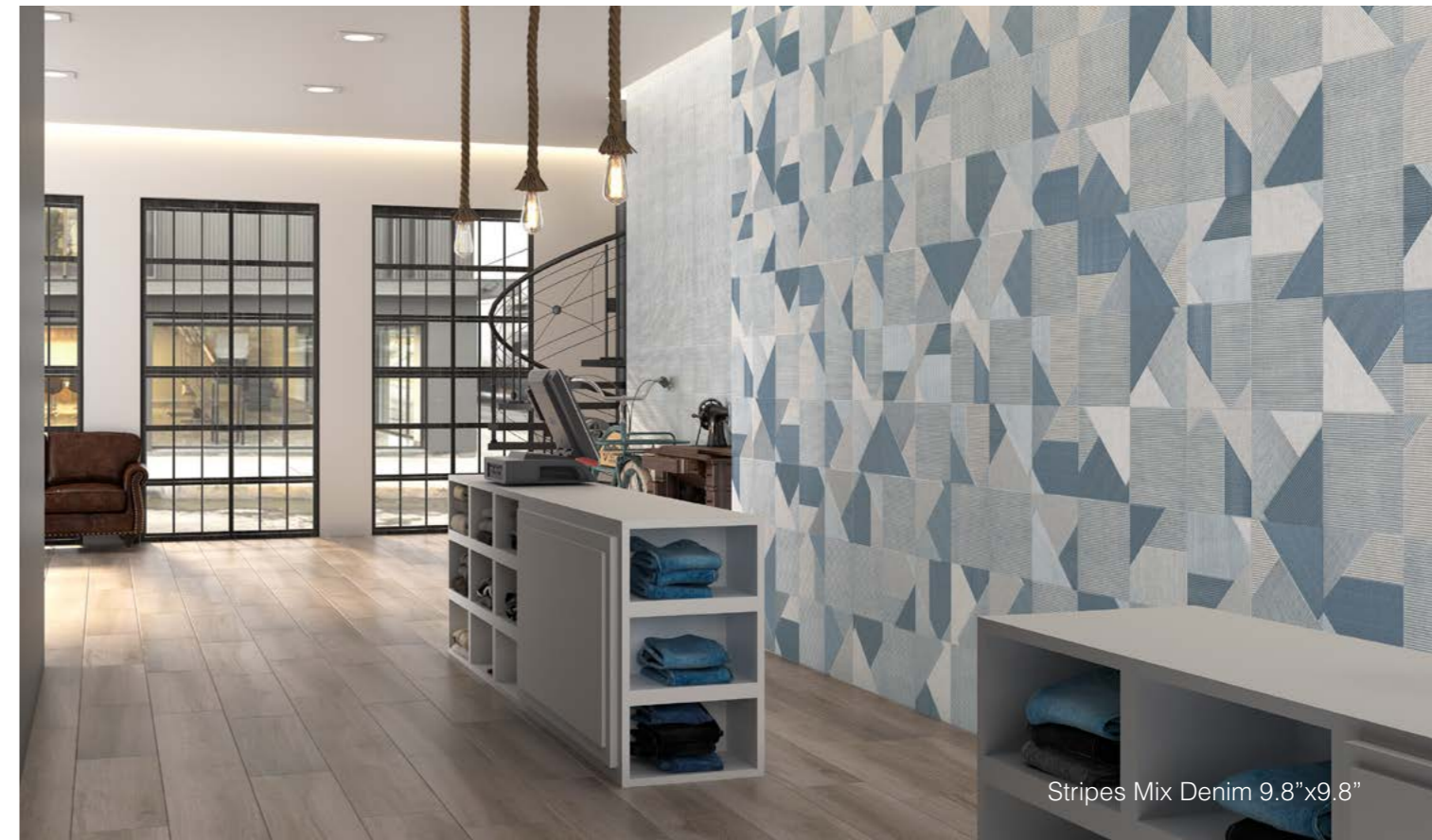
Stripes Mix Denim 9.8"x9.8"