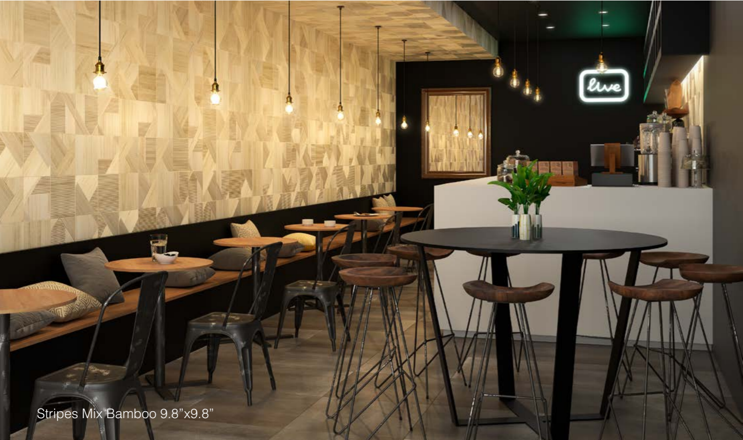
Stripes Mix Bamboo 9.8"x9.8"