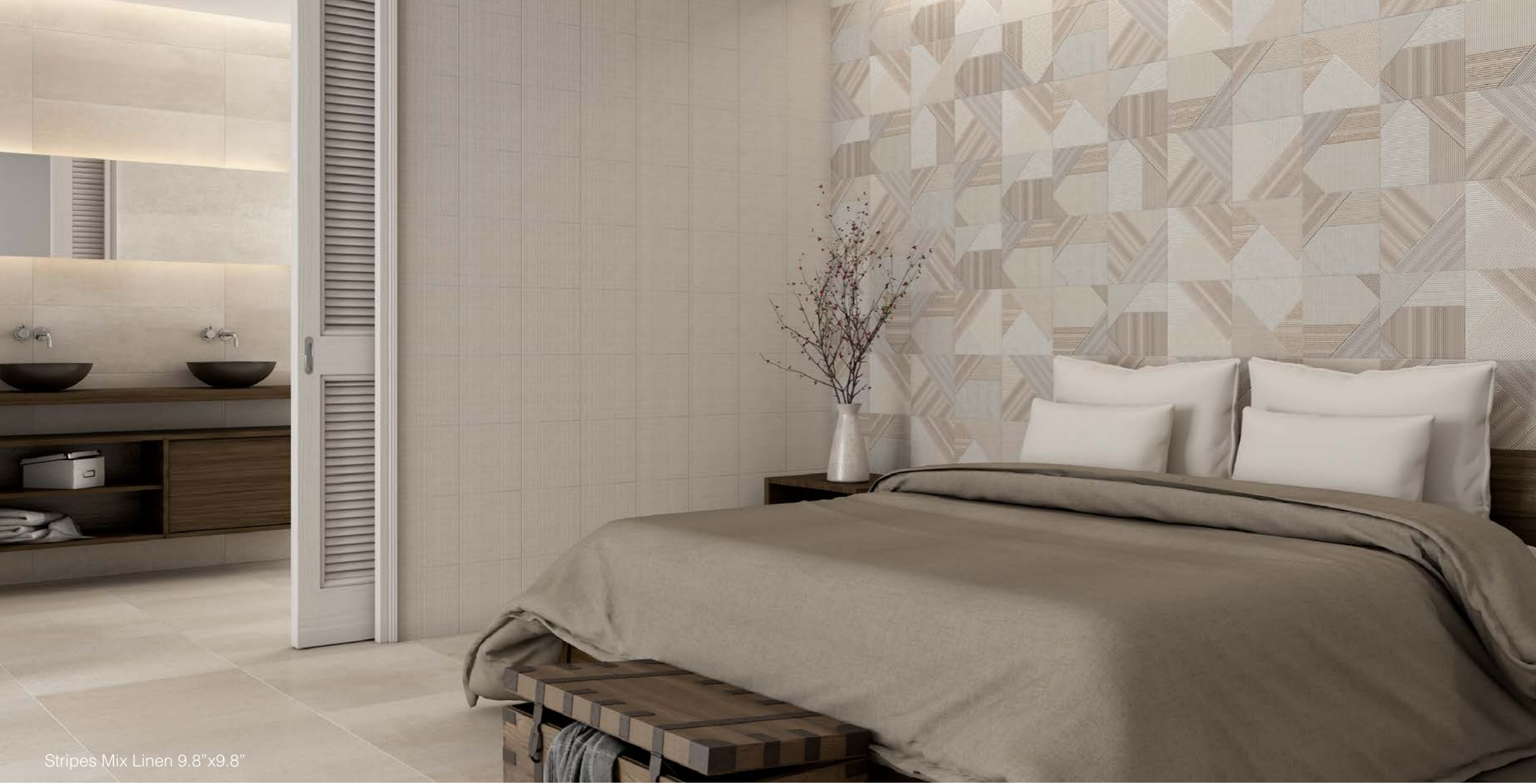
Stripes Mix Linen 9.8"x9.8"