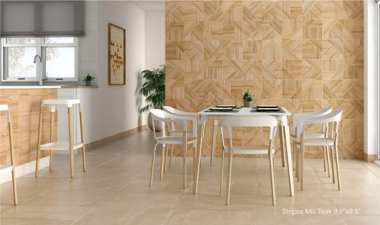
Stripes Mix Teak 9.8"x9.8"