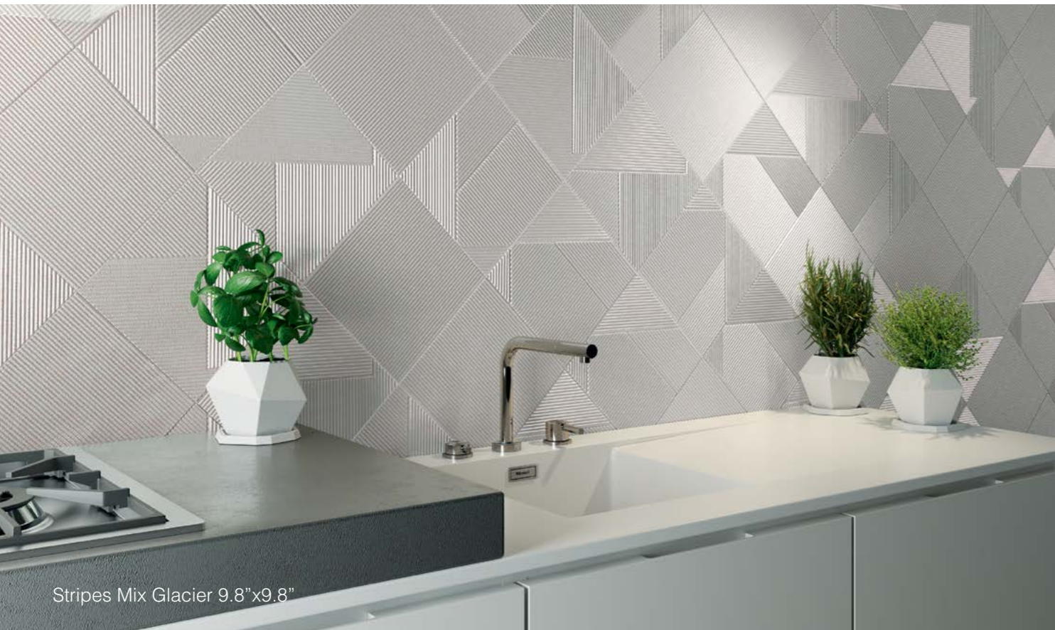
Stripes Mix Glacier 9.8"x9.8"