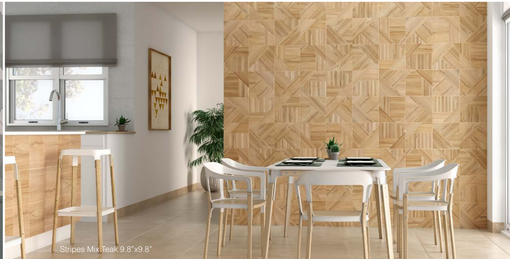
Stripes Mix Teak 9.8"x9.8"