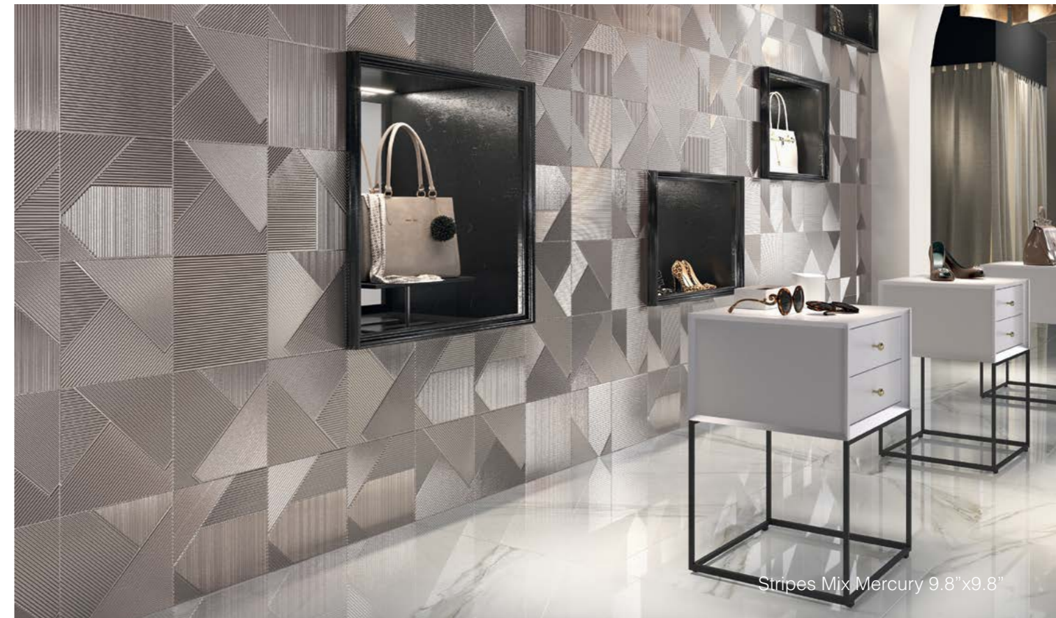
Stripes Mix Mercury 9.8"x9.8"