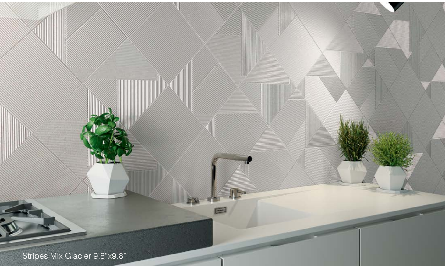
Stripes Mix Glacier 9.8"x9.8"