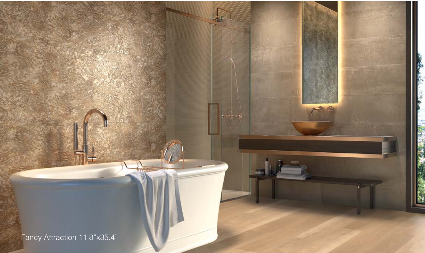
Fancy Attraction 11.8"x35.4"