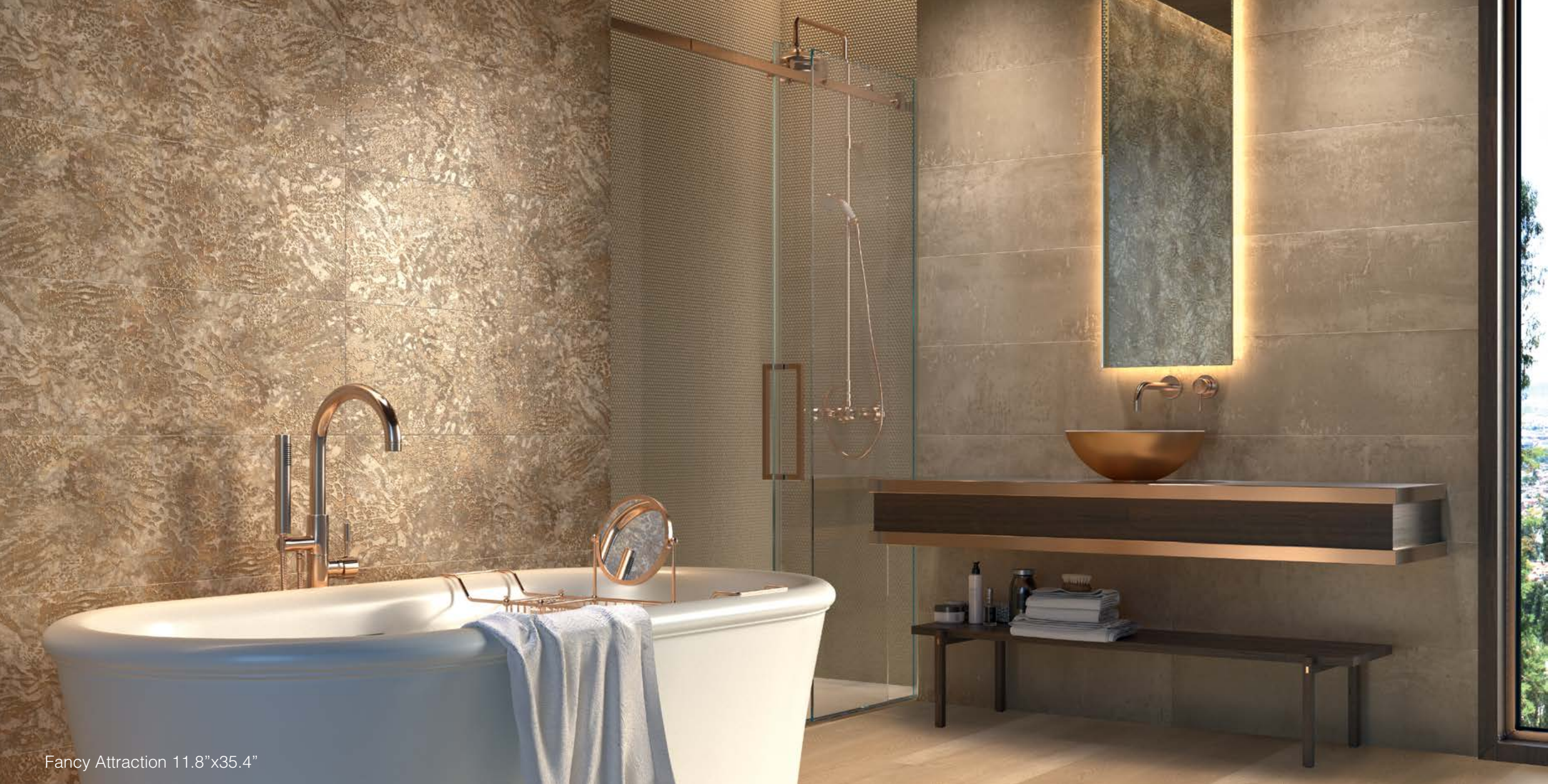
Fancy Attraction 11.8"x35.4"