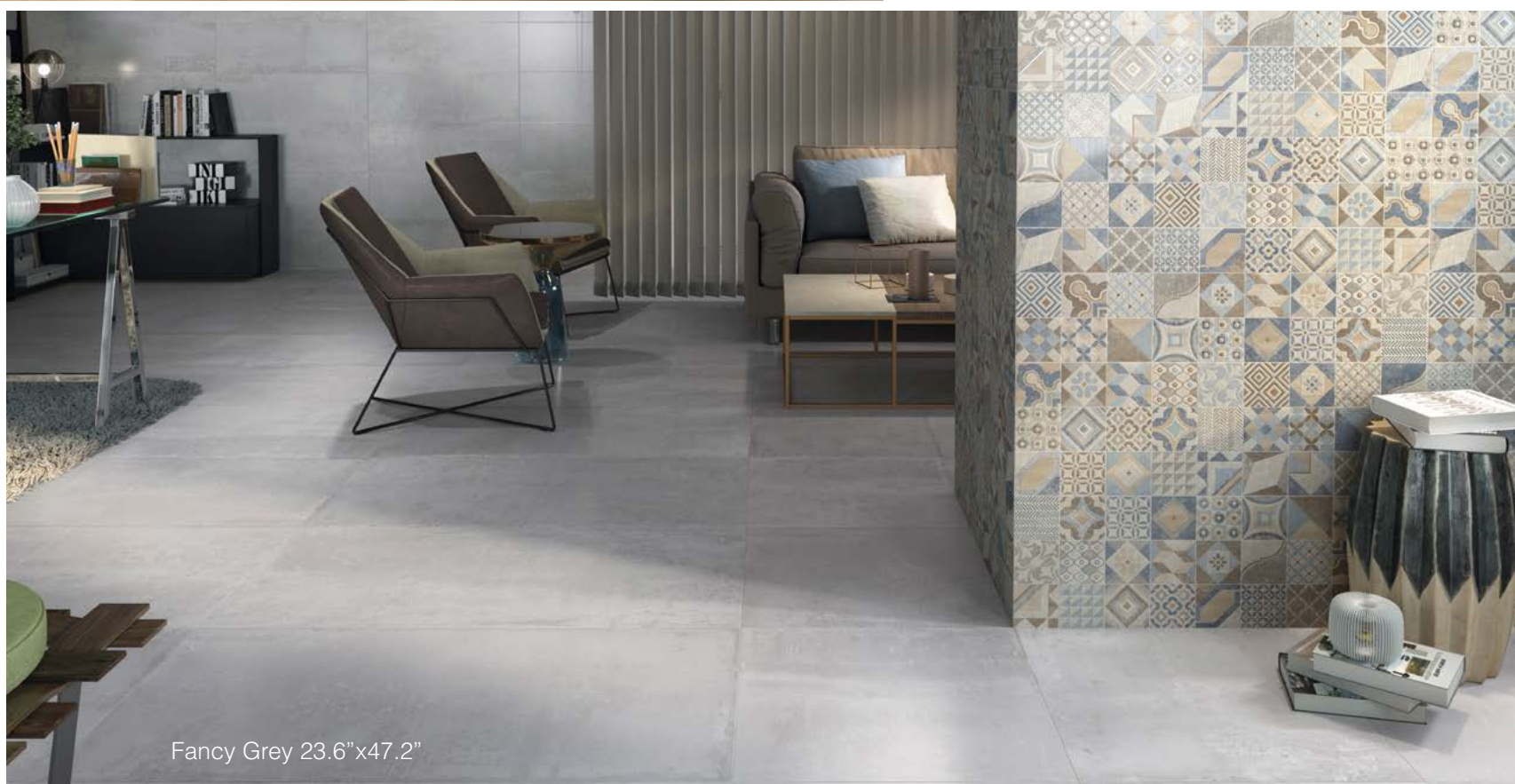
Fancy Grey 23.6"x47.2"