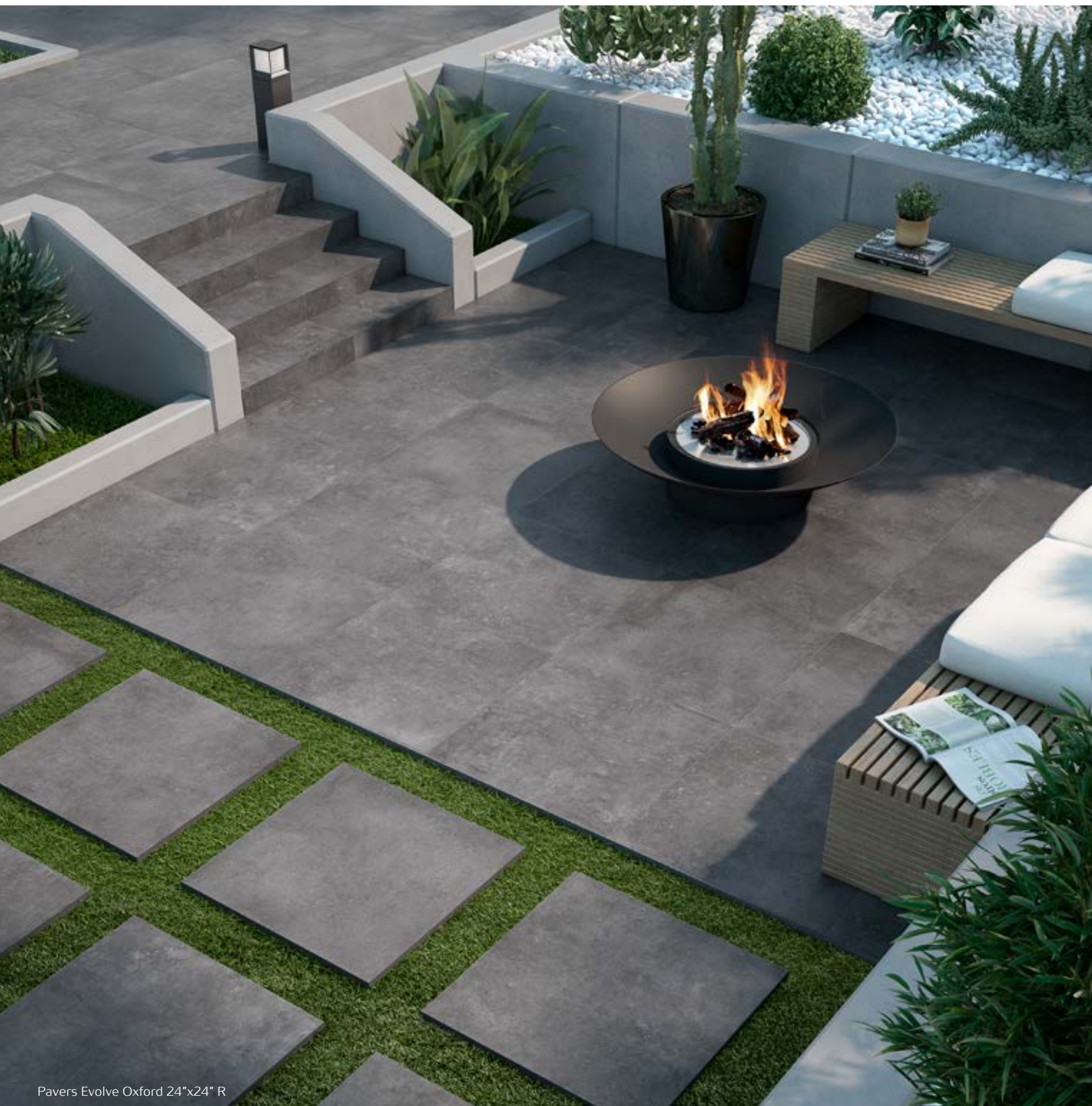
Pavers Evolve Oxford 24"x24" R

These 20 mm thick porcelain tiles surpass the high performance, functionality and aesthetics of natural materials used in flooring, which enables their use in exterior environments and high transit areas.