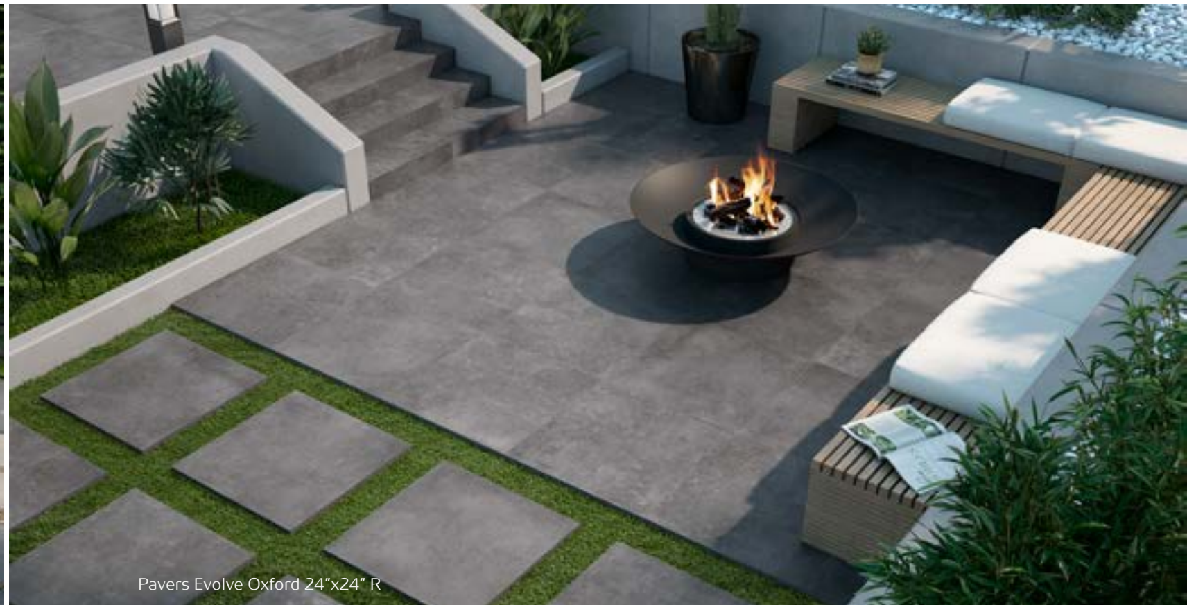
Pavers Evolve Oxford 24"x24" R