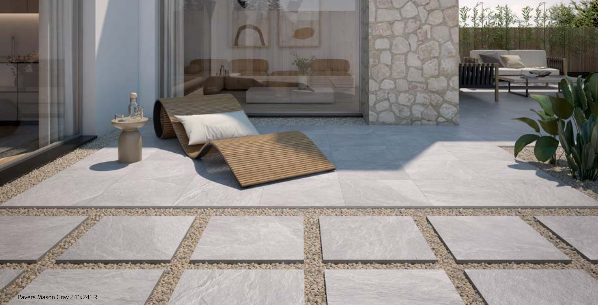
Pavers Mason Gray 24"x24" R