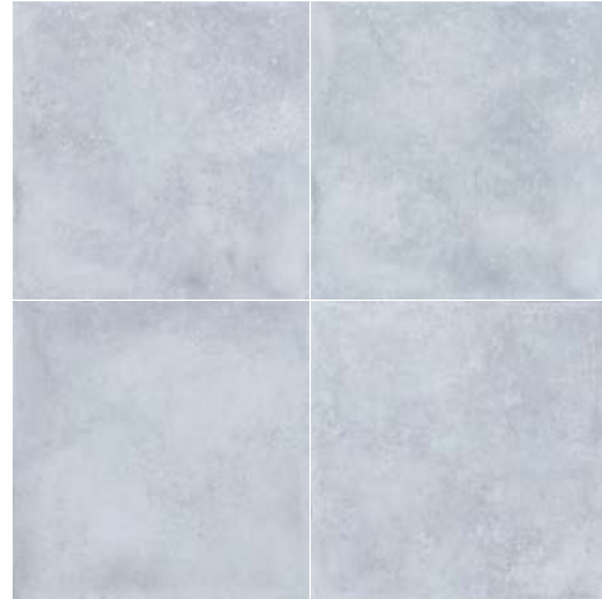
Evolve Light Gray