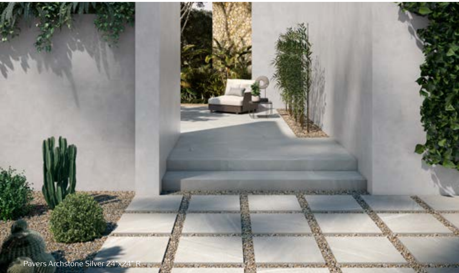
Pavers Archstone Silver 24"x24" R