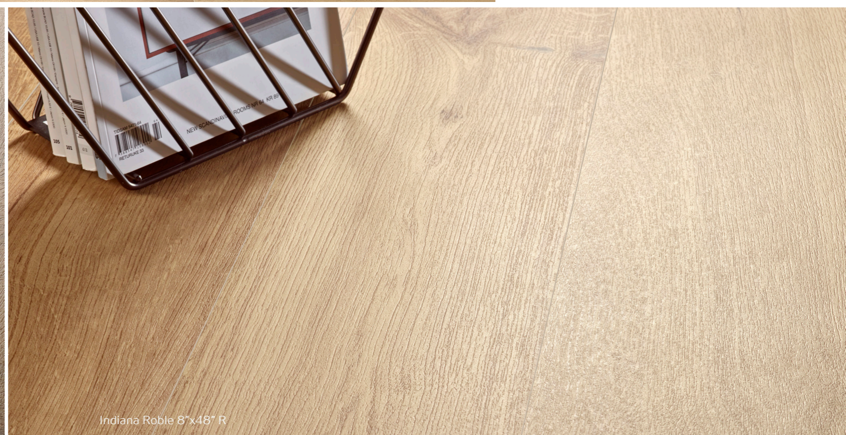
Indiana Roble 8"x48" R