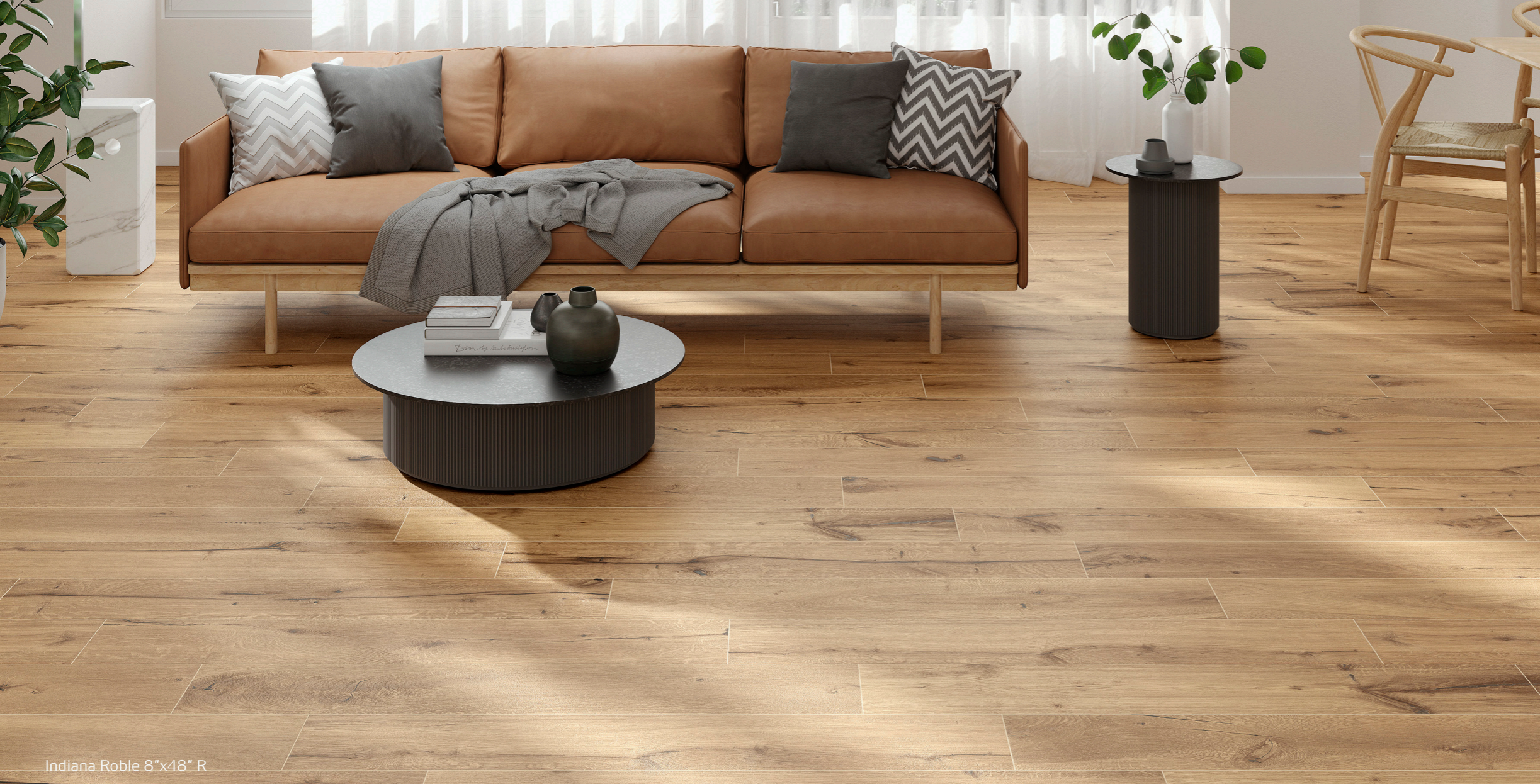
Indiana Roble 8"x48" R