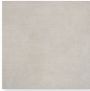
Grey 32"x32" R FJTT6AE021