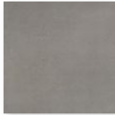
Marengo 24"x24" R FJTT660031