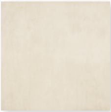
Blanco 24"x24" R FJTT660011