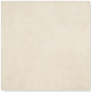
Blanco 32"x32" R FJTT6AE011