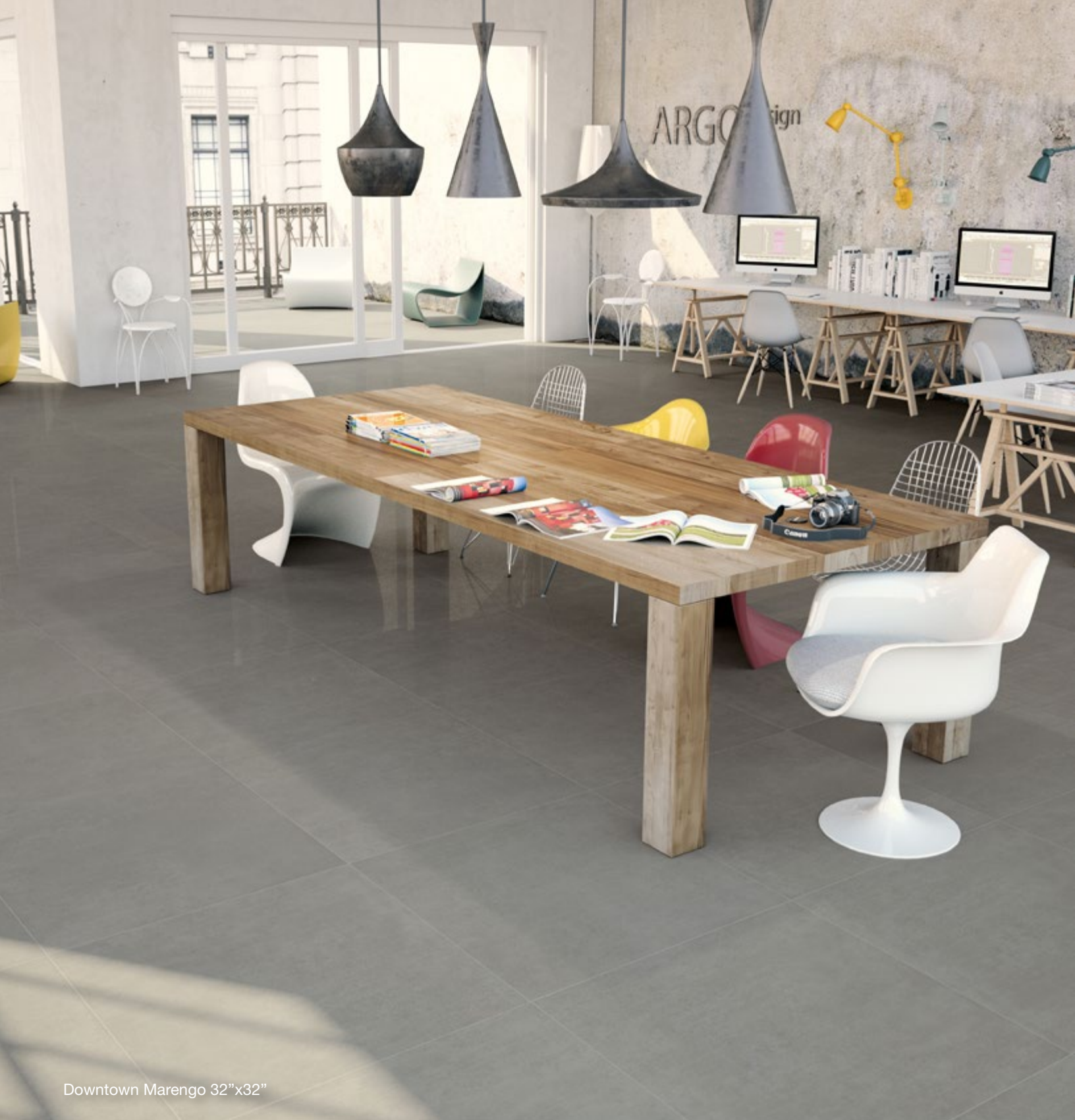
Downtown Marengo 32"x32"