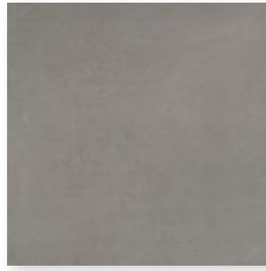
Marengo 32"x32" R FJTT6AE031