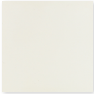
Blanco Polished 24"x24" F236060011