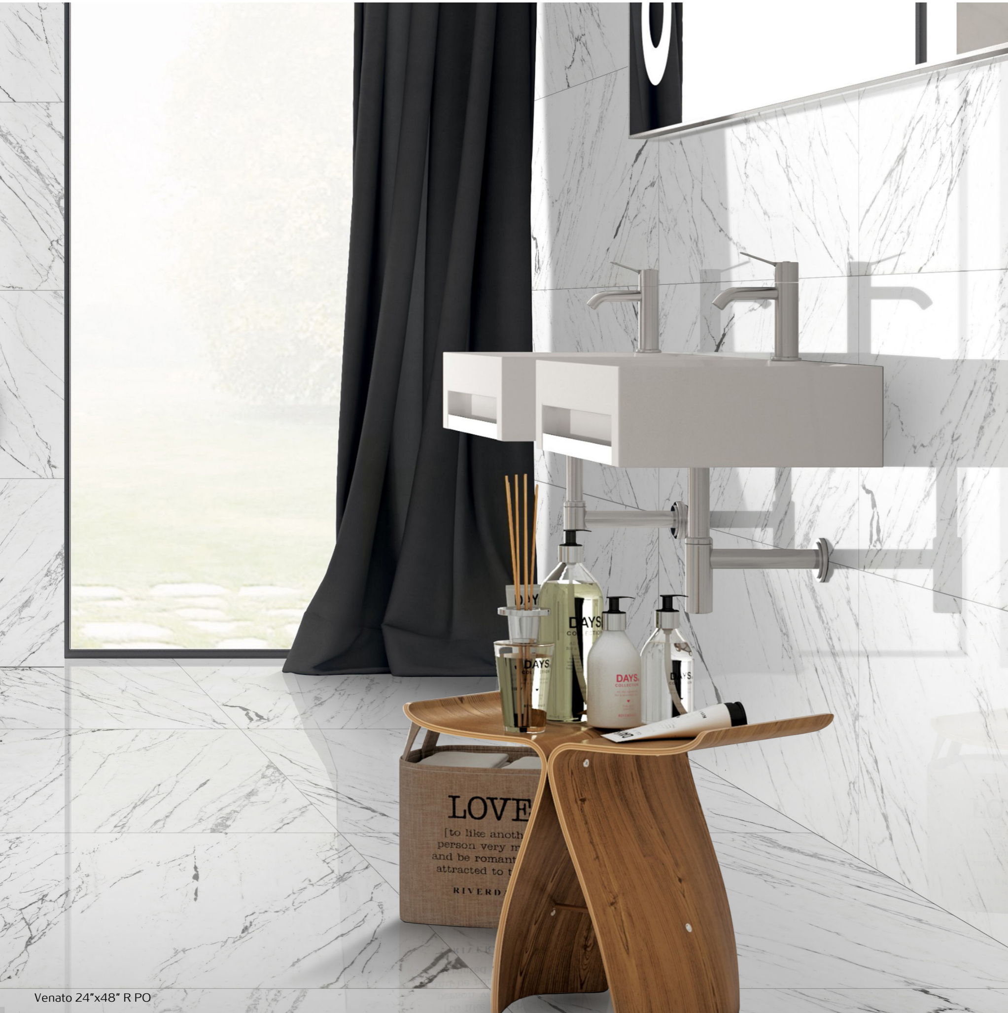
Venato 24"x48" R PO

The Statuario Venato series is inspired by this precious and timeless Italian marble, with veins in shades of gray that run longitudinally through its pieces. Available in polished and matte finishes, HD printing brings this porcelain to life with its realism, elegance and contemporary character.